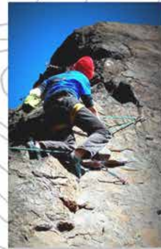
Lily climbing Symphony. 5.12b