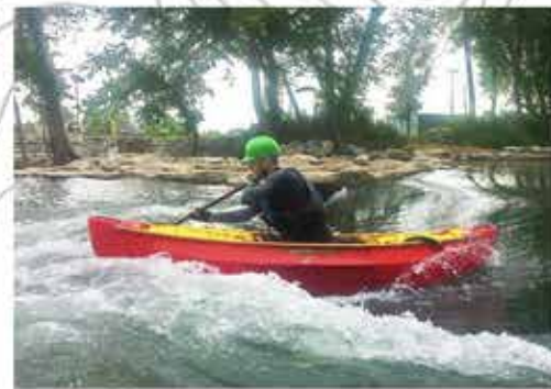
Will paddling at Fisher's Ford